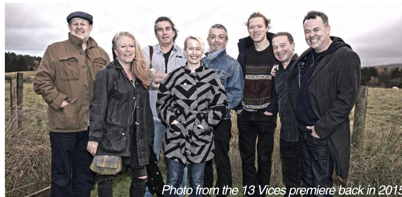
Photo from the 13 Vices premiere back in 2015