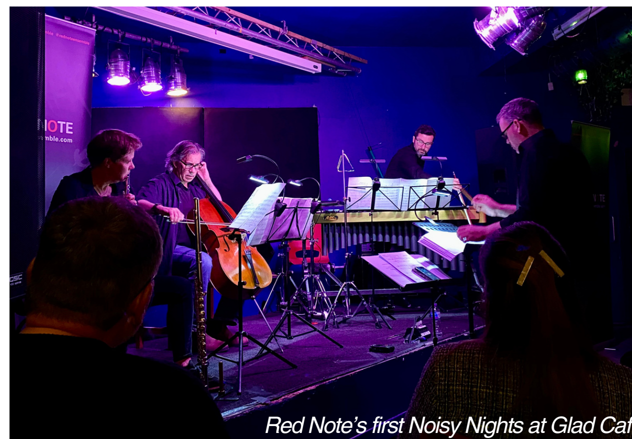
Red Note's first Noisy Nights at Glad Cafe