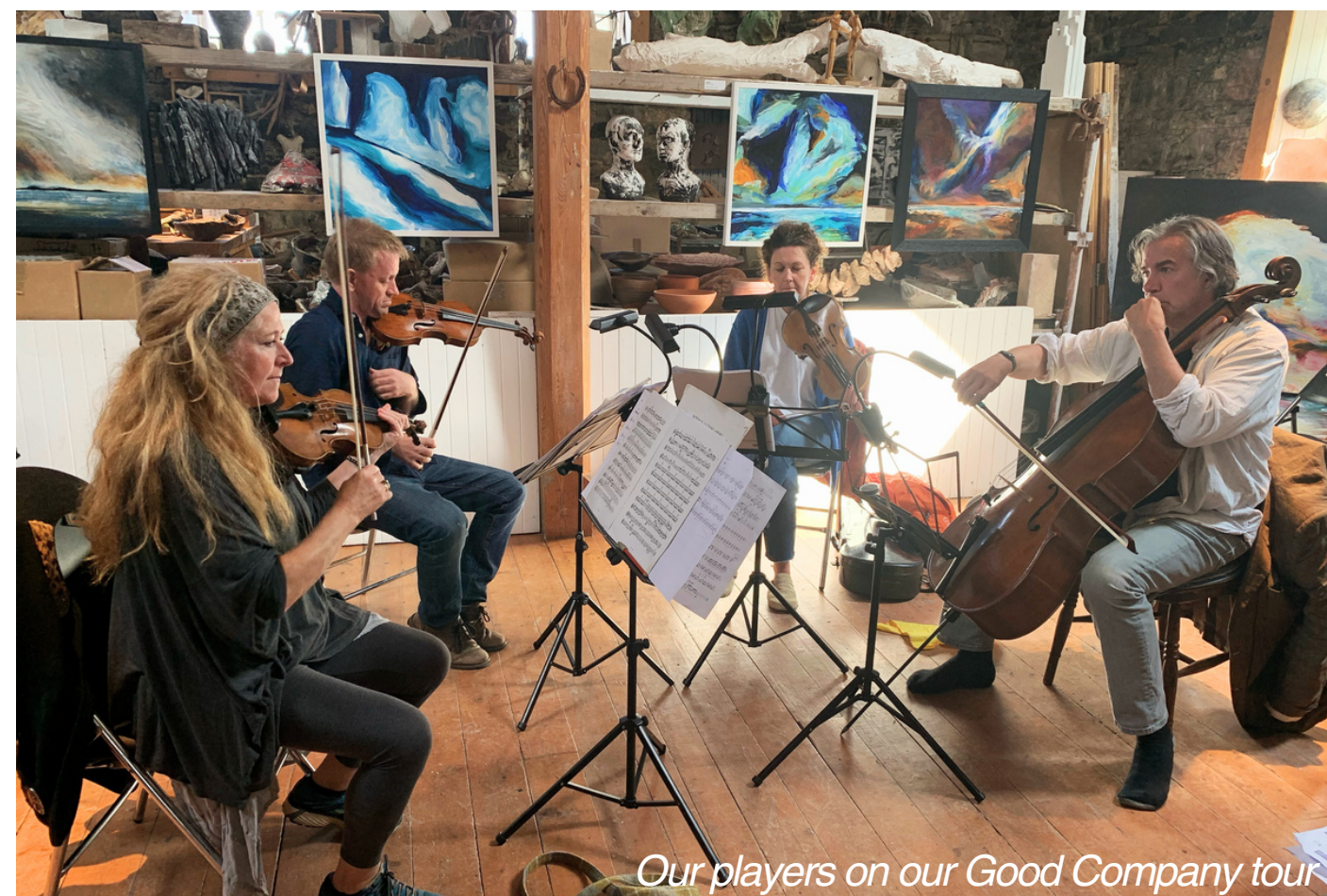
Our players on our Good Company tour

We returned to the Lammermuir Festival in a new venue – the Big Shed in Musselburgh – for a sell-out performance of Gavin Bryar's hypnotic Jesus' Blood Never Failed Me Yet .